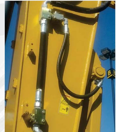
TYPICAL INSTALLATION DIAGRAM : Stick Line Shut Off Valve